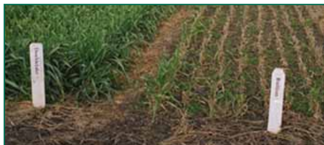
Regrowth of DoubleTake (L) vs. a standard triticale (R)

Many dairy farms also feed cereal silage to milking cows, mainly at the start and end of lactation. The silage is usually grown on run-off blocks, or purchased from local growers. Crops are sometimes grown on milking platforms where they fit in with pasture renewal programmes.