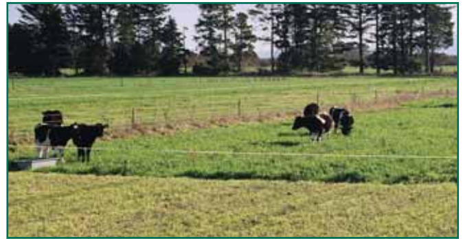
Back-fencing is essential when grazing DoubleTake

When DoubleTake is planted in autumn for multi-grazing, the first grazing is important for subsequent production. A common mistake is to let it develop too much herbage before grazing, and this reduces tiller populations. It should be grazed when it reaches 20-30 cm in height (this can be 60-90 days after planting). A first grazing at 20 cm may be needed with early-planted DoubleTake during warm autumns. If a paddock will take more than five days to graze, start at the lower height so that the last breaks are not too rank. Graze animals for a short duration (1 day) and move them to leave a 10 cm (1200-1500 kg DM/ha) residual. Back-fencing is essential. If you want to restrict animal intake, a run-off paddock may be needed so that the DoubleTake is only grazed for part of the day. Avoid grazing when the soil is wet and soft enough to cause any pugging, because this will severely reduce recovery. The second grazing should be done in a similar manner. If the crop is to be kept for whole crop cereal silage in spring, grazing should be completed by late August in the South Island, and the end of July in the North Island.