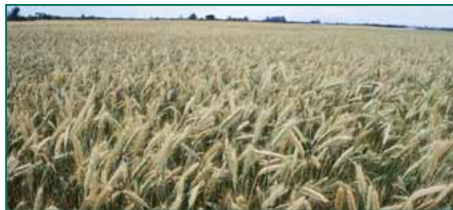
At the correct harvest stage, the crop will have changed from green to mostly yellow.

To produce good quality silage, it is important to cut the crop at the right stage, but also to consolidate and cover well to exclude air, and to manage the pit face when feeding out to minimise spoilage.