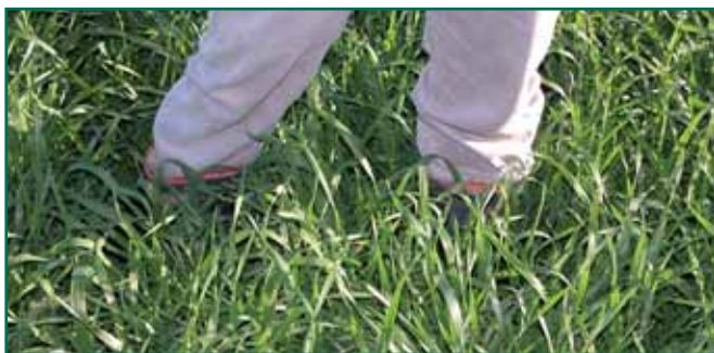
Red-band gumboot height is ideal for grazing

Managing DoubleTake for spring silage. Management through winter can have a large impact on spring silage yields. The aim of winter management is to encourage tiller development and survival, through good fertiliser use and careful grazing. For autumn-planted crops, grazing is necessary to ensure the crop does not get excessively bulky before stem elongation occurs in spring. For detailed information on how to manage DoubleTake in spring for silage, see the website www.agricom.co.nz .